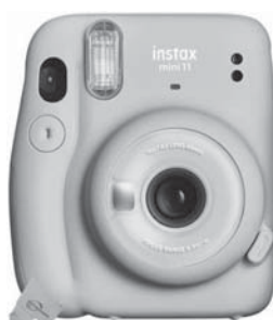
FUJI INSTAX CAMERA