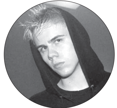
The Kid Laroi Indigenous Singer

"Be Smart, Stay Clean and Live the Dream".