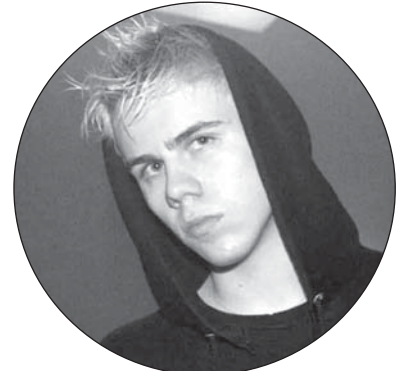
The Kid Laroi Indigenous Singer

"Be Smart, Stay Clean and Live the Dream".